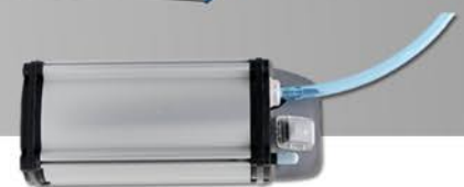
H76 Vacuum Pump