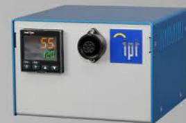
H86 External Temperature Controller