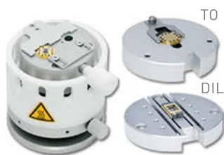
Exchangeable heater plates