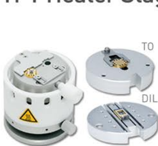
Exchangeable heater plates