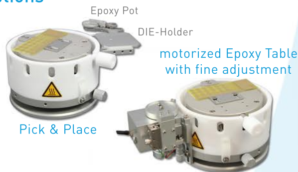
Pick & Place