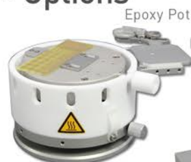
Pick & Place