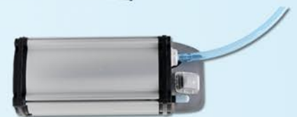
H76 Vacuum Pump

Specifications are subject to change without prior notice