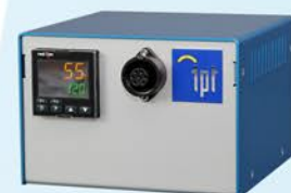
H86 External Temperature Controller