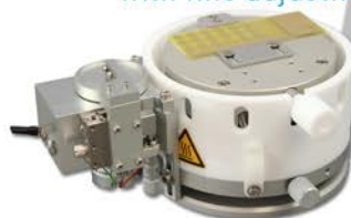
motorized Epoxy Table with fine adjustment