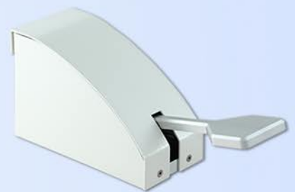
H51 Manual Z-Axis Control