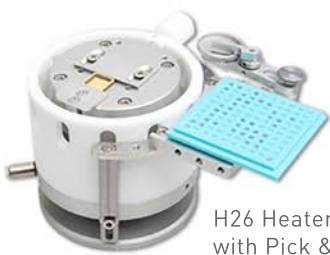
H26 Heater Stage with Pick & Place