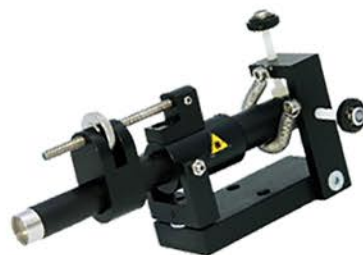
H50 Spotlight Targeting System