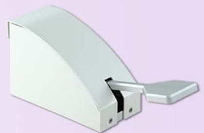
H51 Manual Z-Axis Control