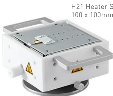
H21 Heater Stage 100 x 100mm