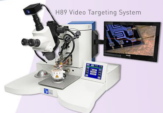
H89 Video Targeting System

Specifications are subject to change without prior notice