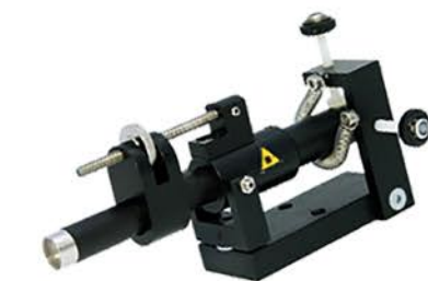
H50 Spotlight Targeting System