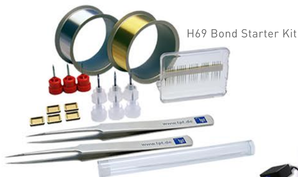
H69 Bond Starter Kit