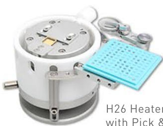
H26 Heater Stage with Pick & Place