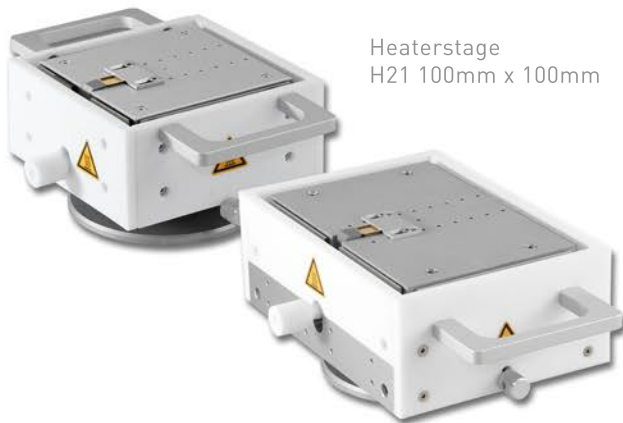
Heaterstage H21 100mm x 100mm