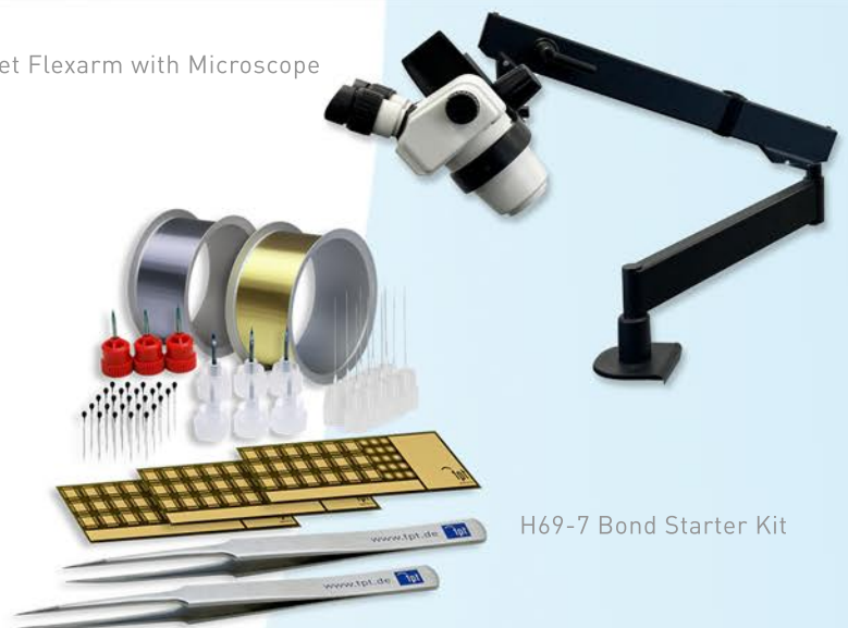
H69-7 Bond Starter Kit