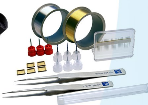
Bond Starter Kit