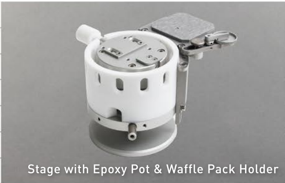
Stage with Epoxy Pot & Waffle Pack Holder

The H80 Pick & Place extension kit does not require a bond head change. Fast and easy change of bond tools lets you switch from die bonding to wire bonding and back.