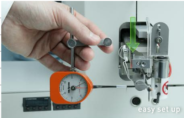
easy set up

The H53 pull tester is a simple solution to test your bonds for bond strength.