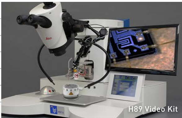
H89 Video Kit

The TPT Spotlight targeting system allows precise aiming with a small laser spot.