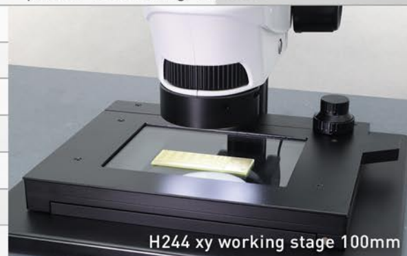
H244 xy working stage 100mm