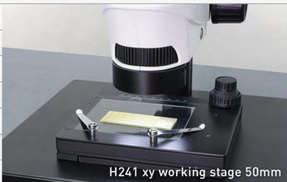
H241 xy working stage 50mm